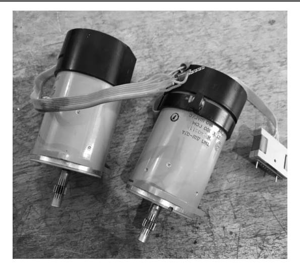
Figure 4. Four-phase stepper motors