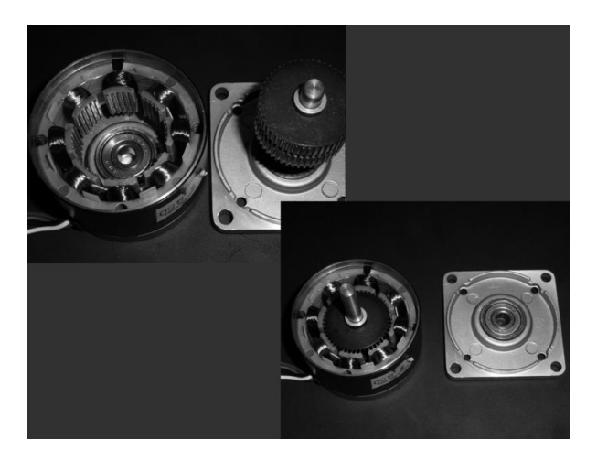
Figure 2. Bipolar hybrid stepper motor

-Bipolar with a single winding per phase. This method will run the motor on only half the available windings, which will reduce the available low speed torque but require less current. Examples of such motor are shown in fig. 2.